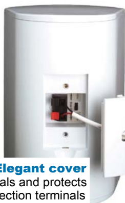
Elegant cover conceals and protects connection terminals

AVIO-805 : Enclosure 10-5/8" W x 13-3/4" H x 10-5/8" D mounting bracket increases depth 1-1/4"