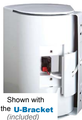
Shown with the U-Bracket (included)